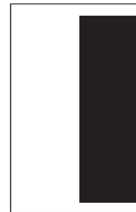
1/2 Page Vertical 4.833" x 15.167" 29p x 91p