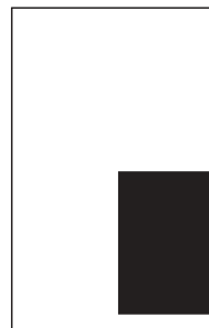
1/4 Page Vertical 4.833" x 7.5" 29p x 45p